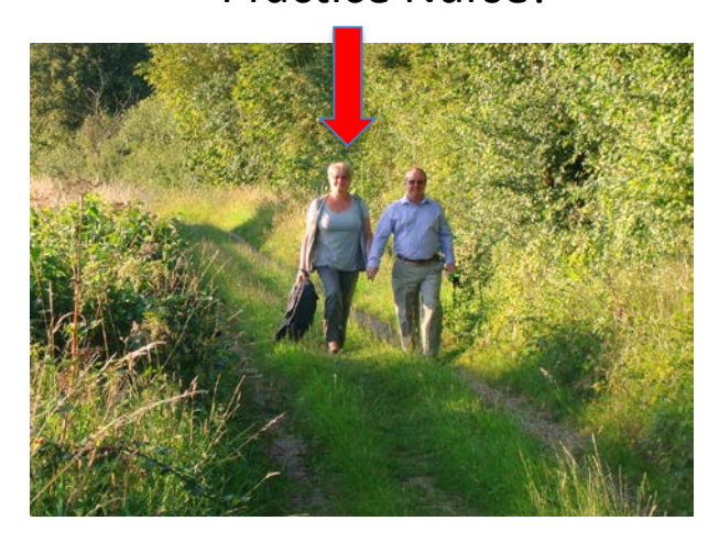
..and I get a pain in centre of chest!!